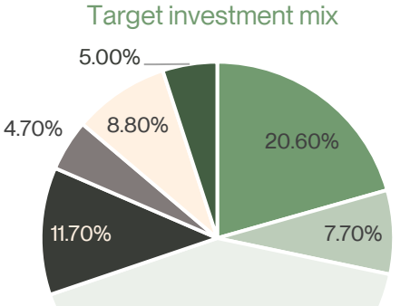
■ Australasian equities: 20.60%